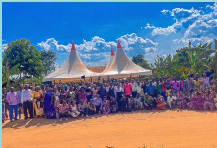
The launch of Kitemi Worship Centre and the attendees of the five-day crusade in Bukomansimbi.

The Jungo Worship Centre started a year ago during the lockdown as an open-air crusade on a horn speaker. Even with no building, it became a place of revival. Many were transformed, revived, and turned to Jesus. Holy Spirit inspired the partners of WOMF to team up to send enough money to acquire land and build the Jungo Worship Centre, a church building, which was dedicated on March 13th, 2022. WOMF has been a vital part of birthing new churches and establishing new ministries across Africa.