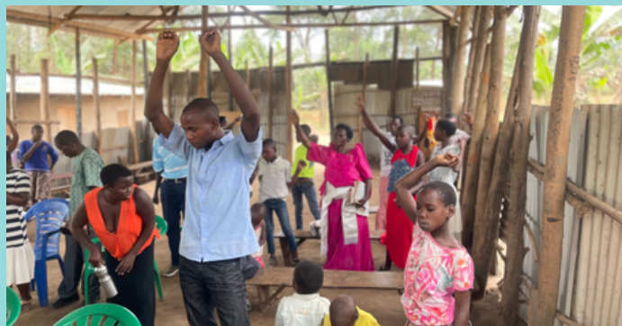
Buyanja Worship Centre holding a church service. They are in the process of making bricks for a permanent building.