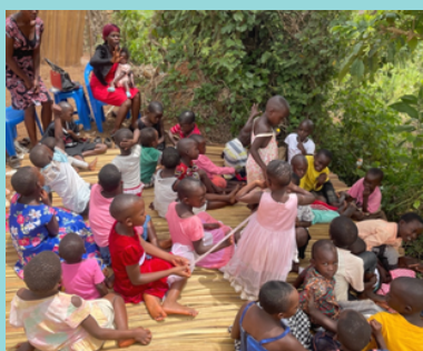
Children of all ages experiencing children's ministry at the Jungo Worship Centre.