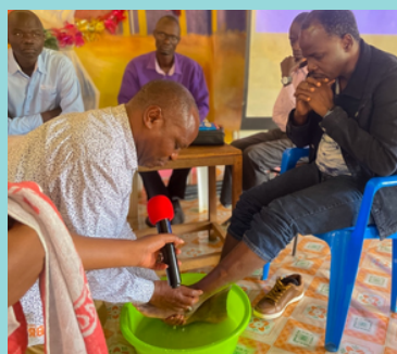
The Annual Zone General Leaders Retreat restored pastors and taught on the importance of being a servant leader and how to love your family as Jesus Christ does.